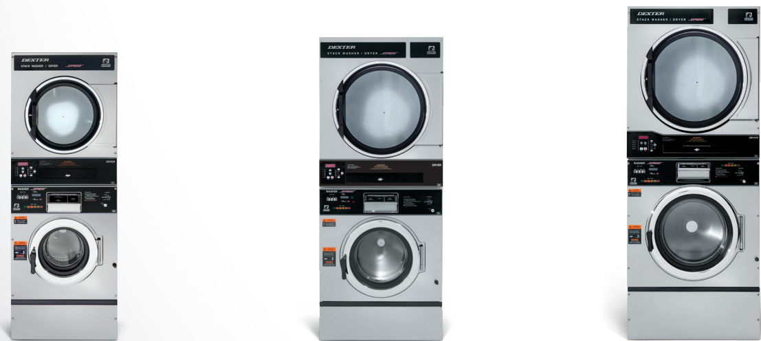
T-350 STACK WASHER-DRYER WASHER: 20 lb (9.1 kg) DRYER: 20 lb (9.1 kg) T-450 STACK WASHER-DRYER WASHER: 30 lb (13.6 kg) DRYER: 30 lb (13.6 kg) T-750 STACK WASHER-DRYER WASHER: 50 lb (22.7 kg) DRYER: 50 lb (22.7 kg) Reversing