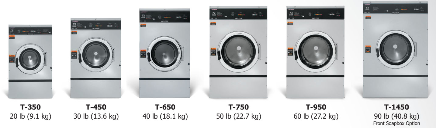
T-350 20 lb (9.1 kg) T-450 30 lb (13.6 kg) T-650 40 lb (18.1 kg) T-750 50 lb (22.7 kg) T-950 60 lb (27.2 kg) T-1450 90 lb (40.8 kg) Front Soapbox Option