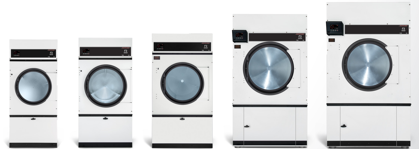
T-30 30 lb (13.6 kg) T-50 50 lb (22.7 kg) Reversing Option T-80 80 lb (36.3 kg) Reversing Option T-120 120 lb (54.4 kg) Reversing T-170 170 lb (77.1 kg) Reversing