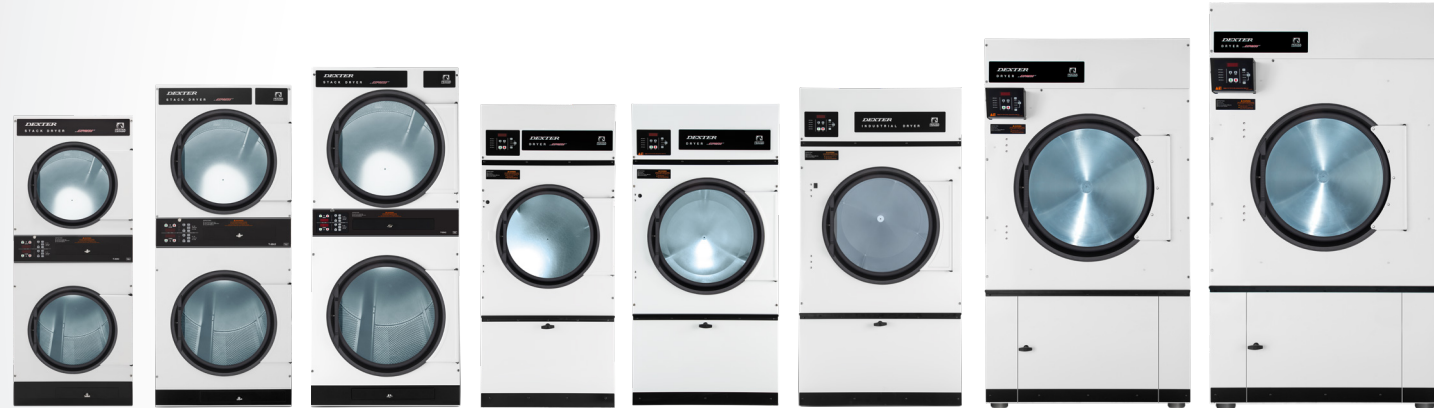
T-20x2 2 x 20 lb (2 x 9.1 kg) T-30x2 2 x 30 lb (2 x 13.6 kg) T-50x2 2 x 50 lb (2 x 22.7 kg) Reversing Option T-30 30 lb (13.6 kg) T-50 50 lb (22.7 kg) Reversing Option T-80 80 lb (36.3 kg) Reversing Option T-120 120 lb (54.4 kg) Reversing T-170 170 lb (77.1 kg) Reversing