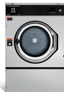
S-975 60 lb (27.2 kg)