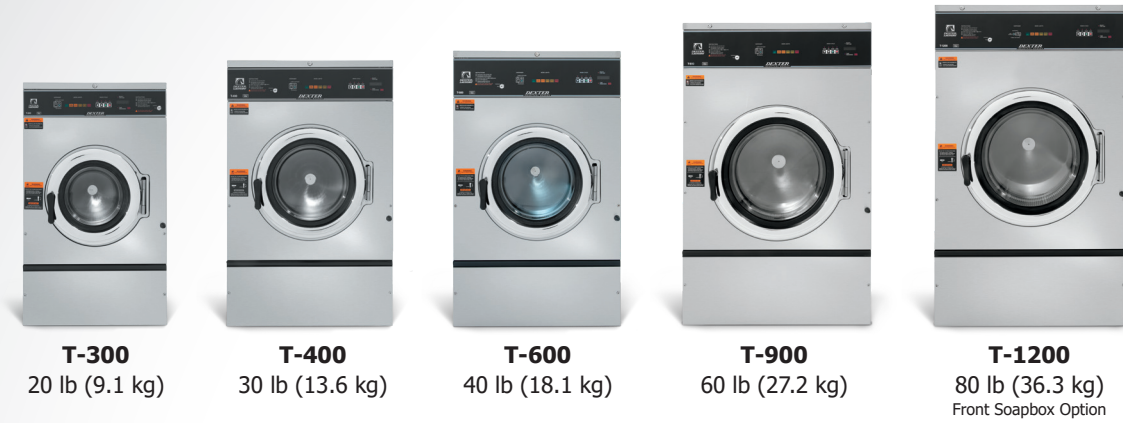
T-300 20 lb (9.1 kg) T-400 30 lb (13.6 kg) T-600 40 lb (18.1 kg) T-900 60 lb (27.2 kg) T-1200 80 lb (36.3 kg) Front Soapbox Option