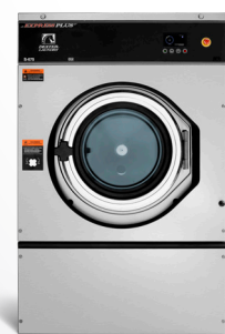
S-675 40 lb (18.1 kg)