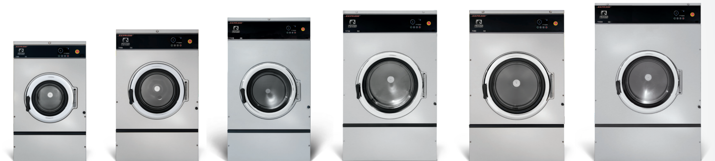
T-350 20 lb (9.1 kg) T-450 30 lb (13.6 kg) T-650 40 lb (18.1 kg) Electric & Steam Heat Options Express Plus Option T-750 50 lb (22.7 kg) T-950 60 lb (27.2 kg) Electric & Steam Heat Options Express Plus Option T-1450 90 lb (40.8 kg) Electric & Steam Heat Options Express Plus Option Front Soapbox Option